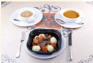
Sample “allergen-free” meal